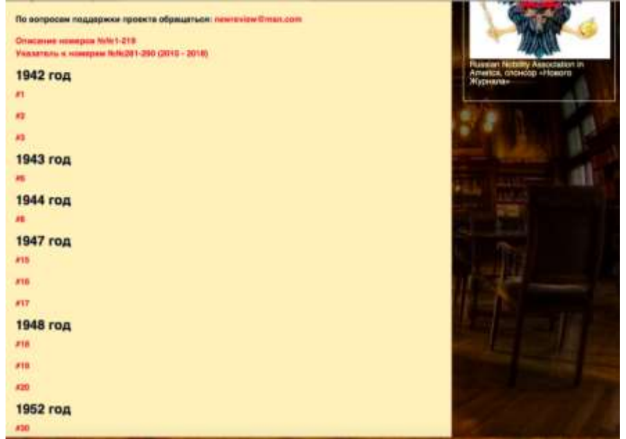
Sample screen of the Novyi zhurnal archive.

The venerable <u>Novyi zhurnal</u>/The New Review has uploaded a free, downloadable partial digital collection of archival issues, from 1942 onwards. As of this writing, it includes issues 1-3, 6, 8, 15-20, 30-47, 49-66, 100, 114-136, 138-139, 282-297, and an index to 2015-2019. By the way,